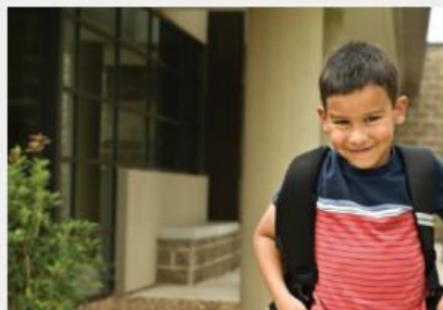
Stock a backpack with food