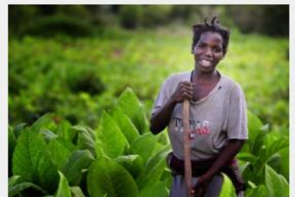
Farmers' field school for a woman