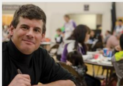
Feed 10 people at a soup kitchen